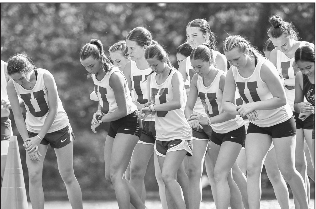
The Union County ladies are currently ranked among the top-three in Class AA.

By Todd Forrest Sports Editor sports@nganews.com